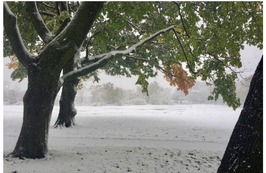
Our spooky pre-Halloween snowfall.