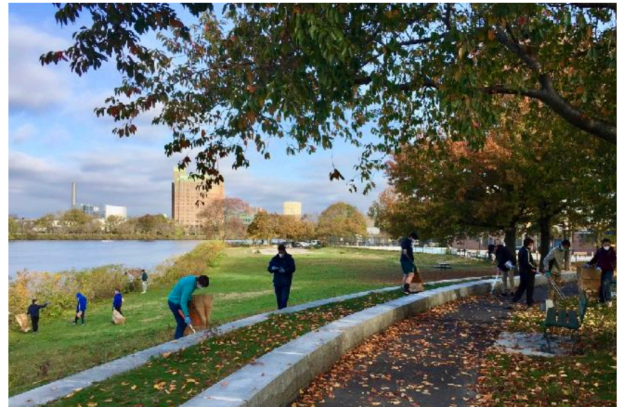
CRC volunteers picked up litter, weeded, pruned and cut back invasives.