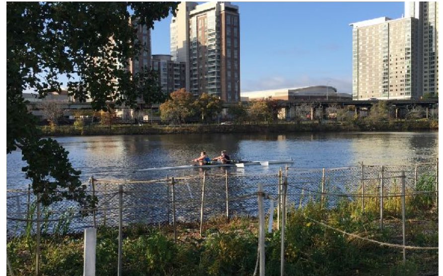
Just across the Charles River is the noisy, raised I-90 viaduct. We advocated for it to be replaced with a more sustainable, multi-modal alternative.

We supported MIT in its efforts to bring its rowers to the park this spring when their boathouse was under construction. Sadly, despite extensive preparations, pandemic restrictions prevented this from happening.