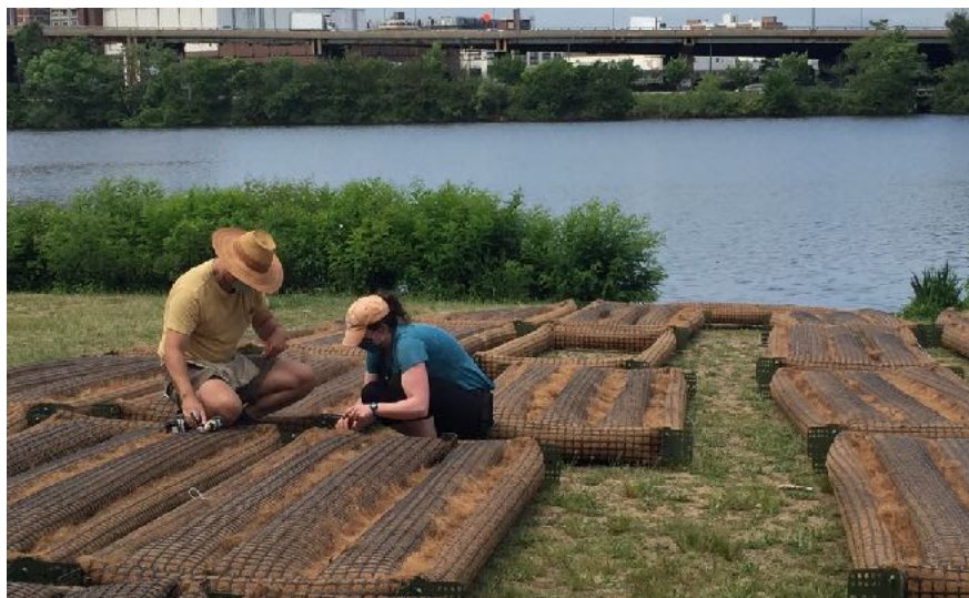
The CRC launched its floating wetland from the park in June as part of a 2-year study to see how it might inhibit cyanobacterial blooms in the river.