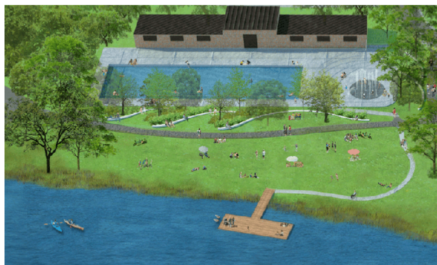
A grassy beach, a dock and an outlook will better integrate the pool with the park and increase engagement with the river. Rendering courtesy of Crosby Schlessinger Smallridge