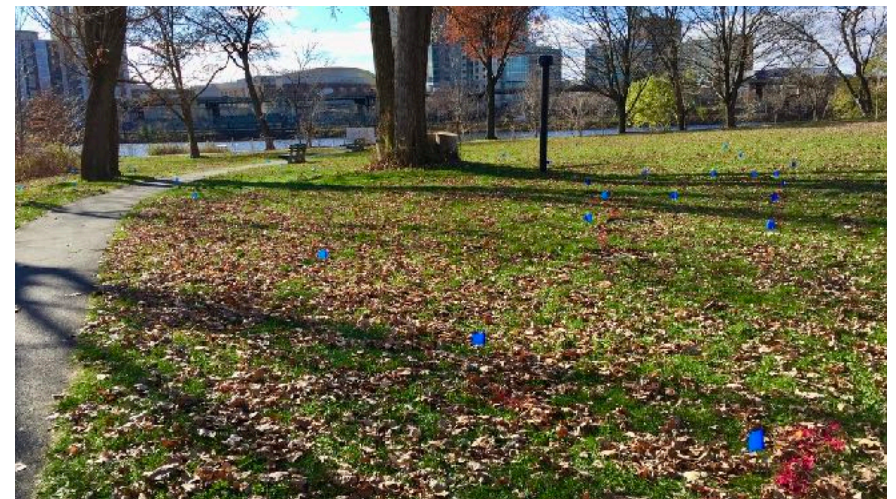
Surveyor flags dotted the park to mark existing utilities for Eversource. Eversource's goal: to bury high voltage lines on the grounds.