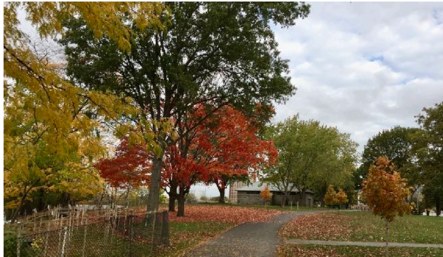
Young trees now line the path to the Powder Magazine.

Magazine Beach Partners is thankful for DCR's many contributions. That said, like many multi-sector capital projects and larger initiatives, our park improvement plans face significant delays. For plans, see "What's Next" on page 8.