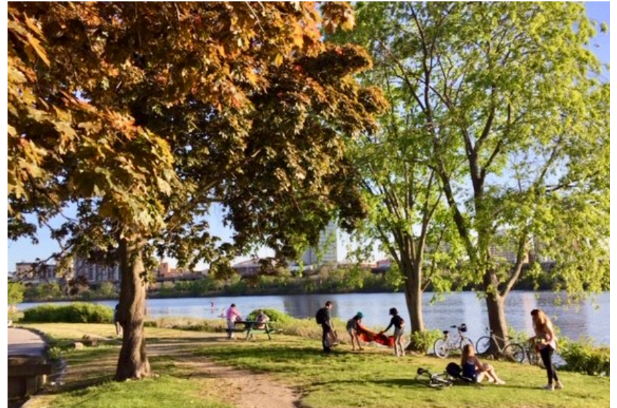
A warm and sunny day in May.

* Expenditures have been underwritten by an individual donor.