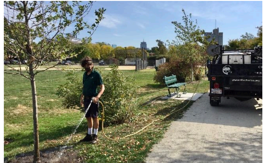
The CRC waters the new trees along the shoreline during the drought.

Finally, when the pandemic kept groups from engaging in clean ups of the park, we invited individuals to help, providing them with work gloves and trash bags. And many did!