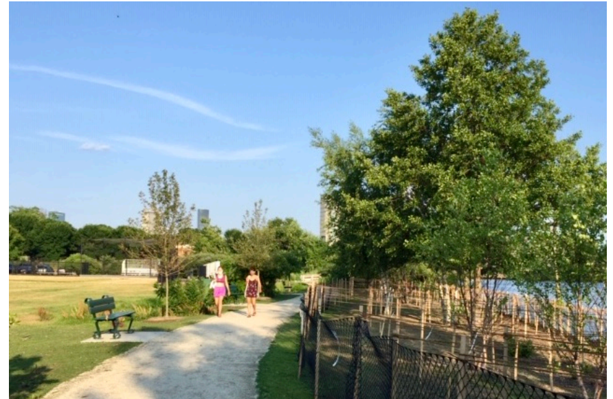
The shoreline path with goose netting to protect plantings.