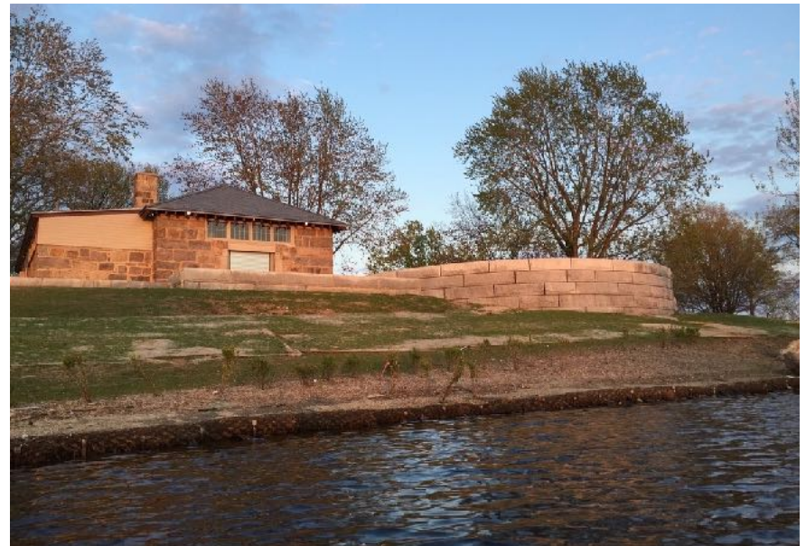
The Powder Magazine with its new granite terrace.