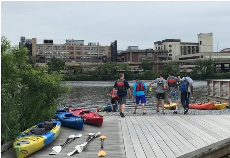
Waypoint Adventure at the park in 2019.