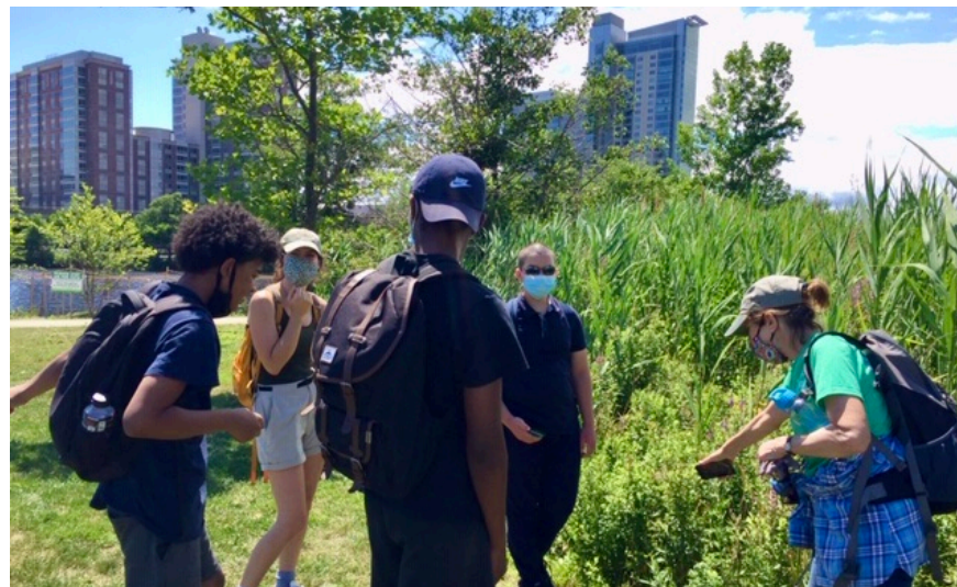
MS4B has brought teens to the park for 3 years now, to plant meadows, do service work, and learn about the importance of biodiversity.