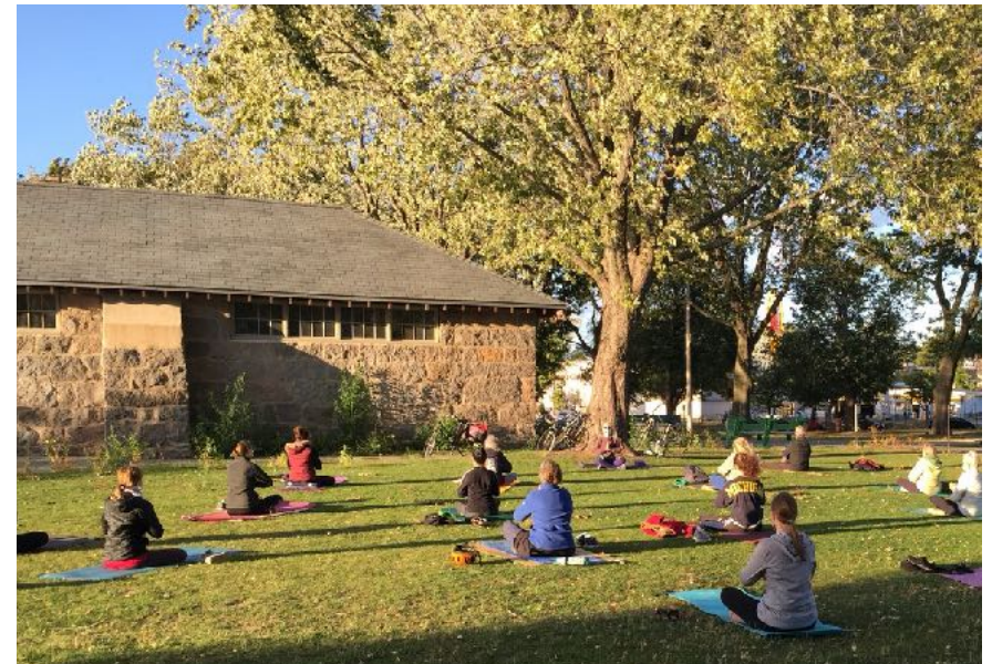
Come fall, neighbor yogi Carol Faulkner led outdoor classes.