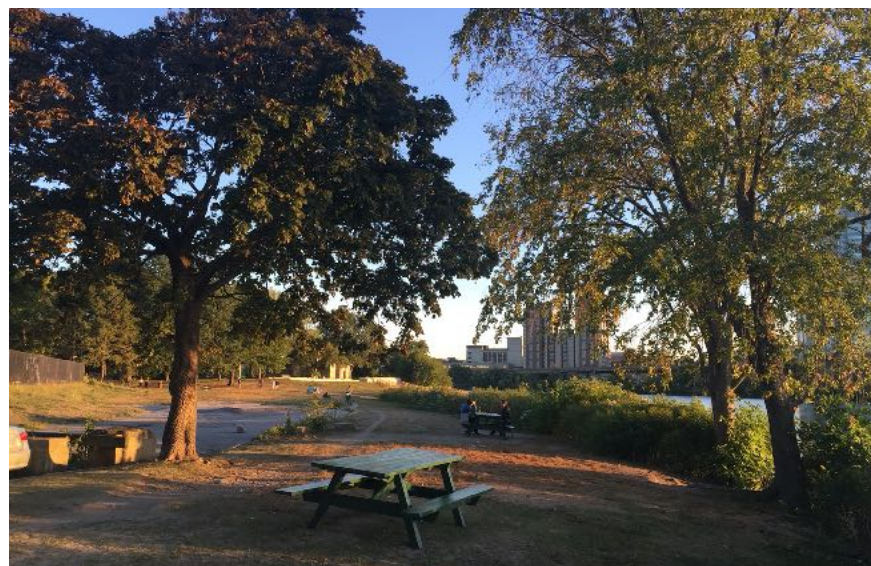
Phase II-2 will turn the sunken parking lot into a grassy beach.

Contact Cathie Zusy at czusy@magazinebeach.org or 617.868.0489