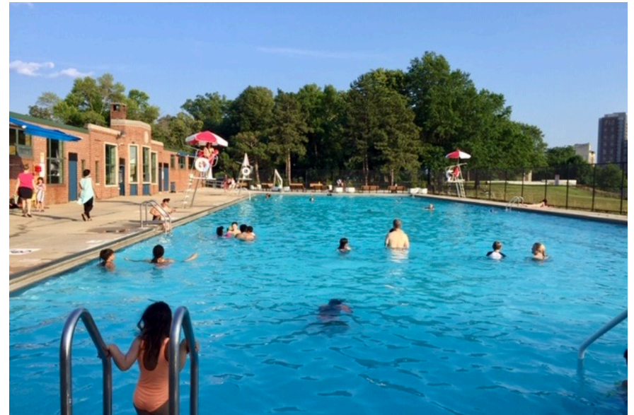
The pool opened at 50% capacity. No covid-19 was reported!